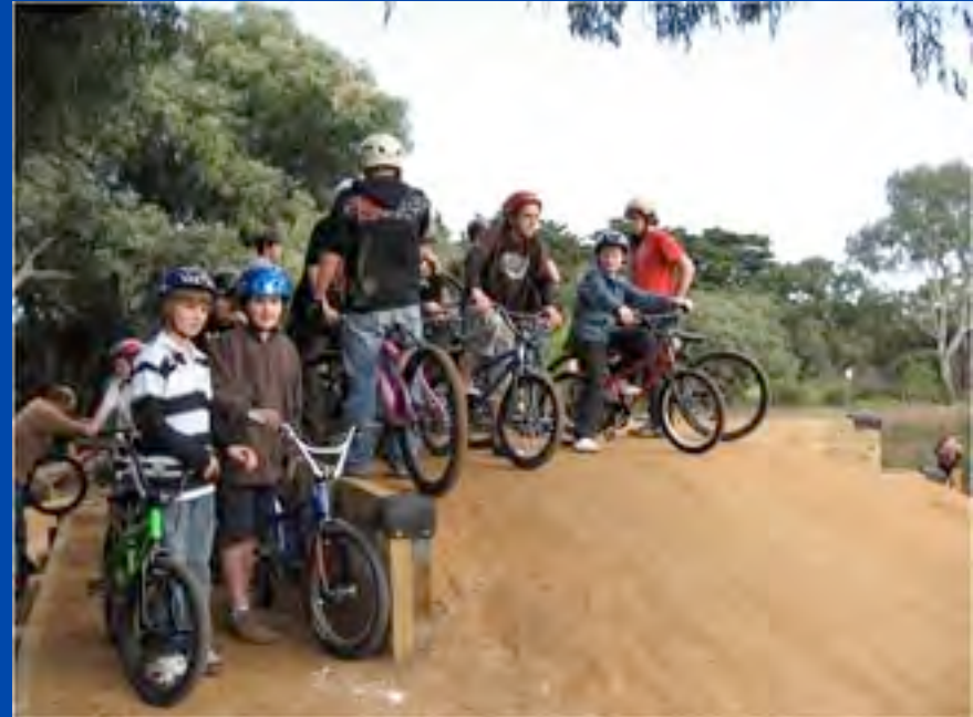
BMX Dirt Jump Clinic