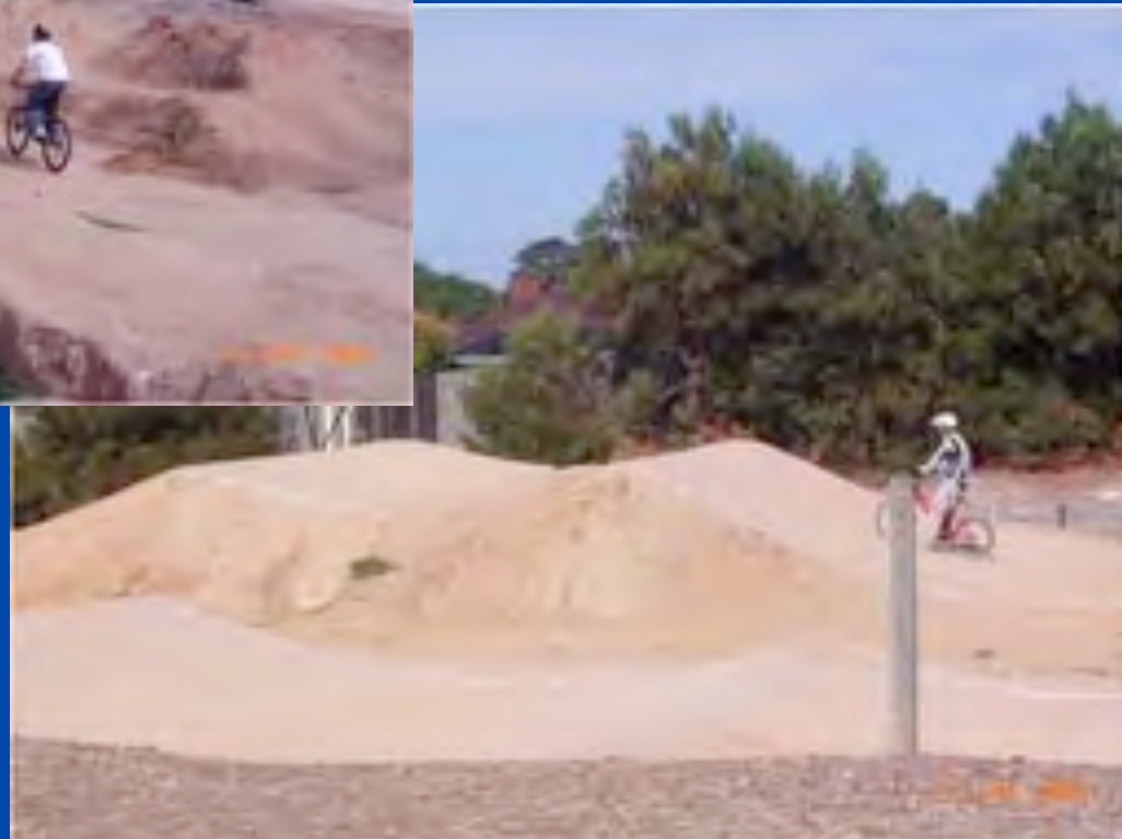
Oakleigh Race Track