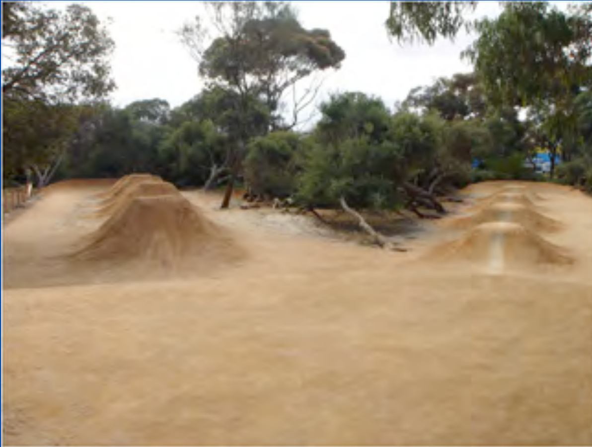
Bayside BMX Dirt Jumps