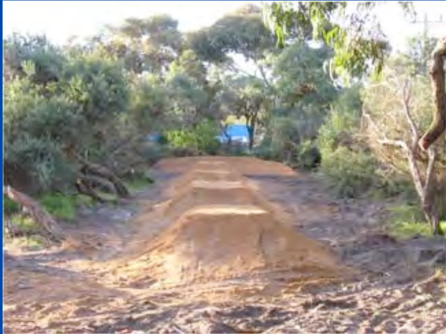
Vegetation Clearing and Table Top Jump Construction