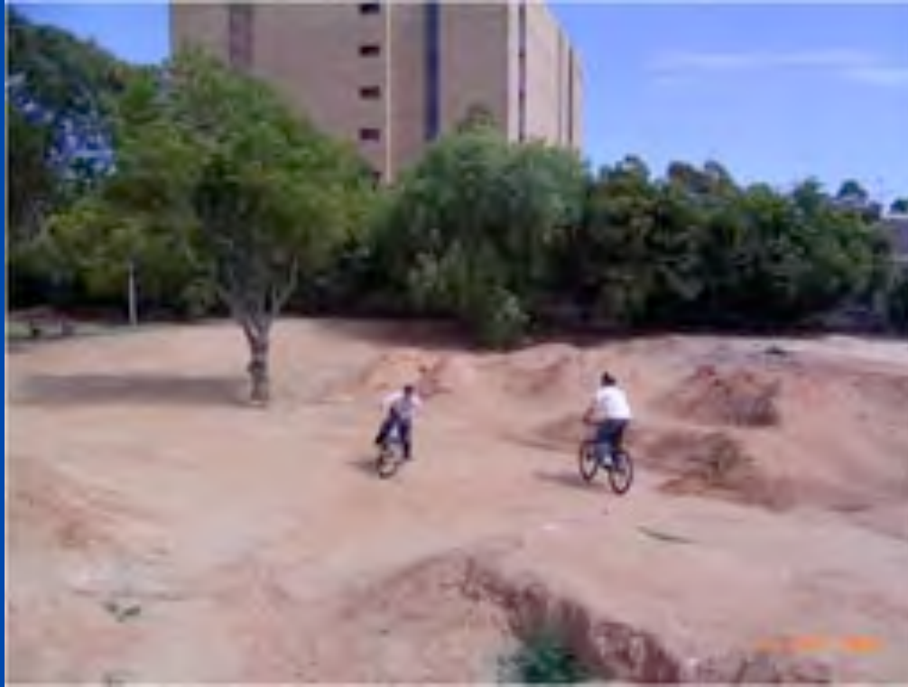
Prahran Dirt Jumps