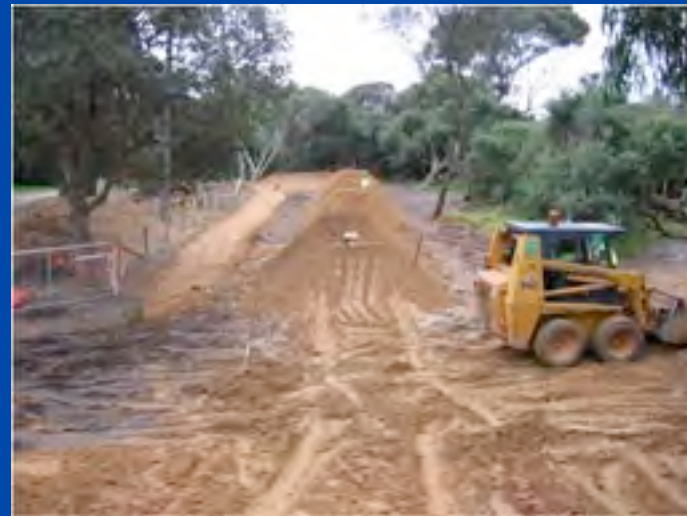
Construction of 1.5m Jumps