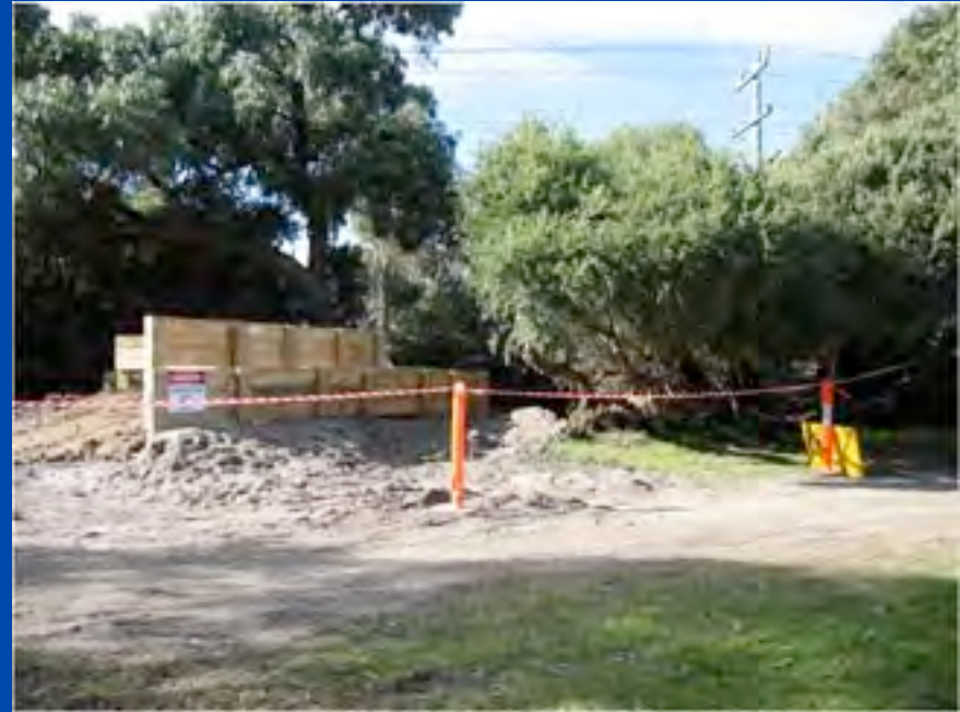
Start Mound Construction