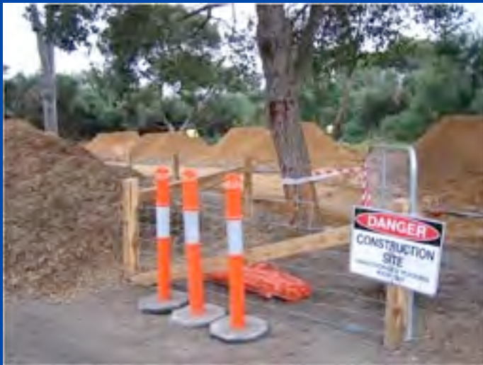
Restricting access prior to opening